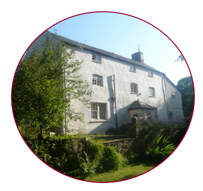
Church Farm Guesthouse